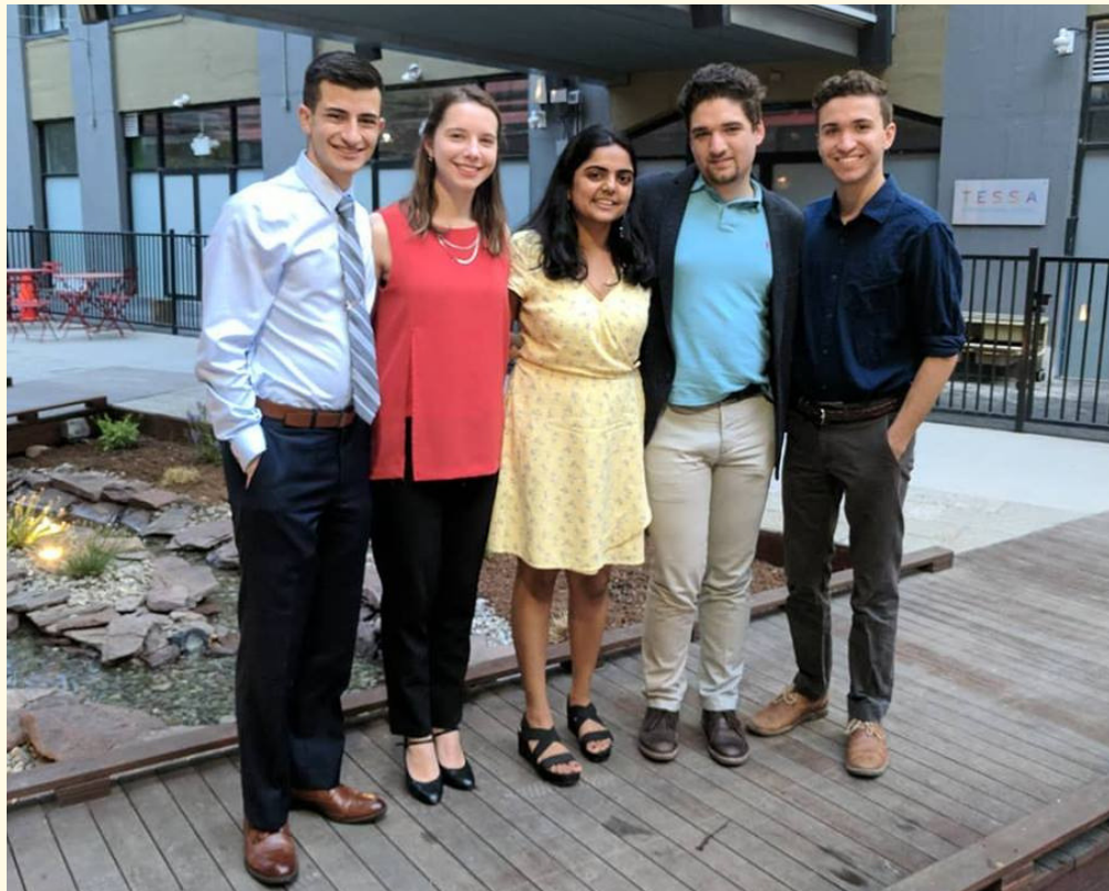
Executive Board at Spring 2018 Stute Dinner