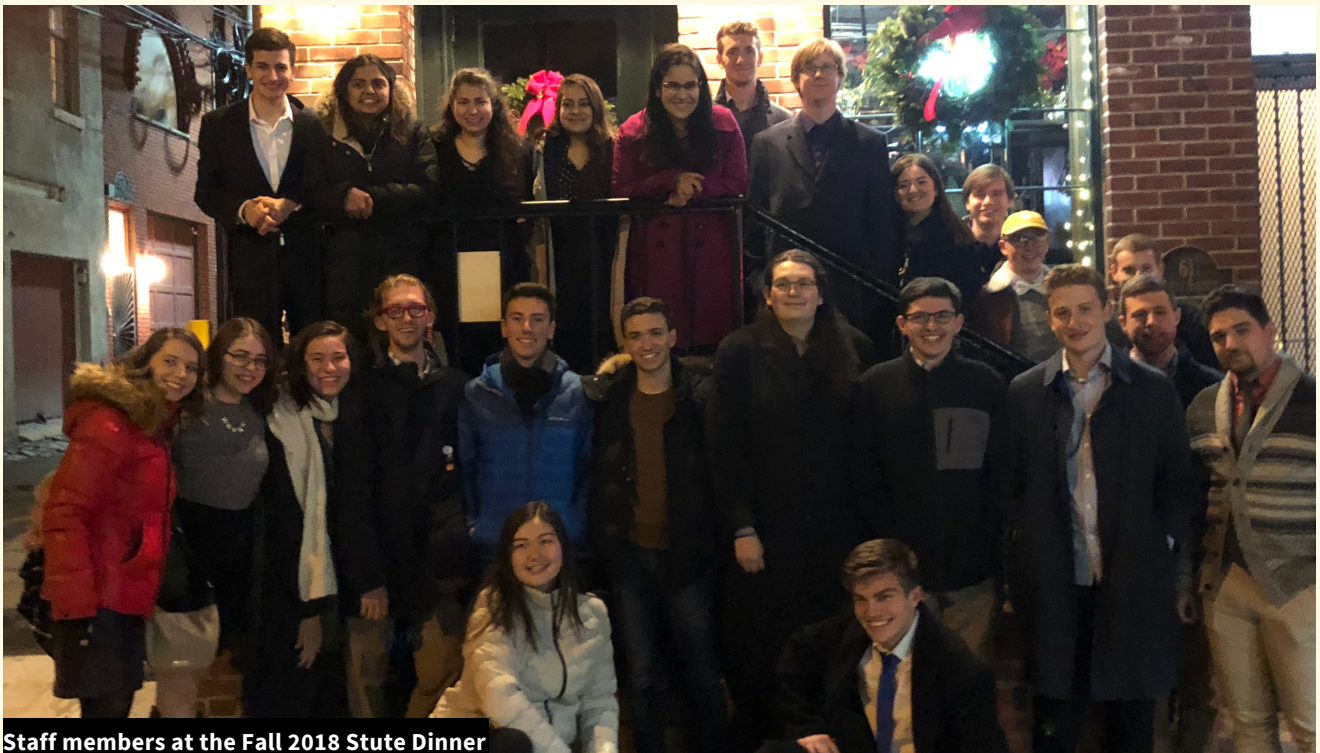
Staff members at the Fall 2018 Stute Dinner