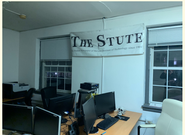
Last night of layout in The Stute office