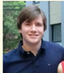
Cole Yarbrough Head Photographer